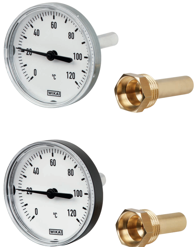
Upper fig.: Steel case, galvanised Lower fig.: Plastic case

The model A43 is manufactured to tolerance class 2 in accordance with EN 13190 and thus offers the required indication accuracy for heating technology.